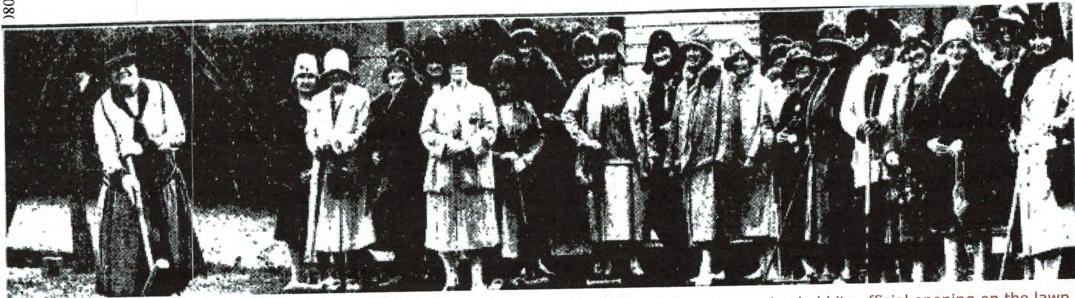
Papers Past > Auckland Star > 17 October 1930 > Page 8 > THE UNITED .CROQUET CLUB yesterday held its official opening on the lawn in the Domain. Members are ... [truncated]