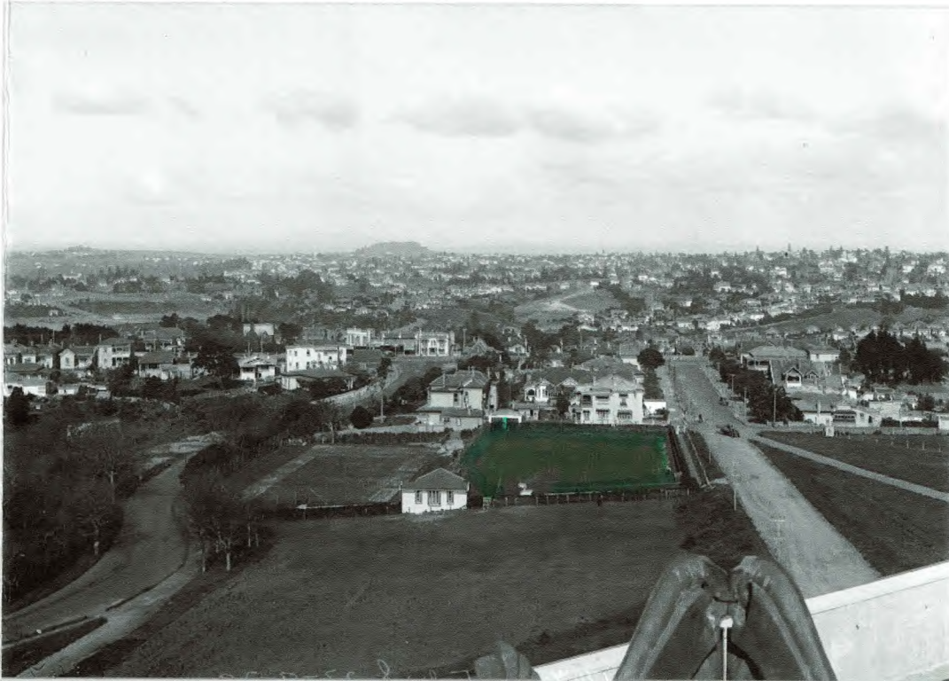
Panoramic view looking east from the Auckland Museum...1929