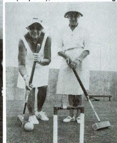
Croquet players, Papatoetoe, 1980.