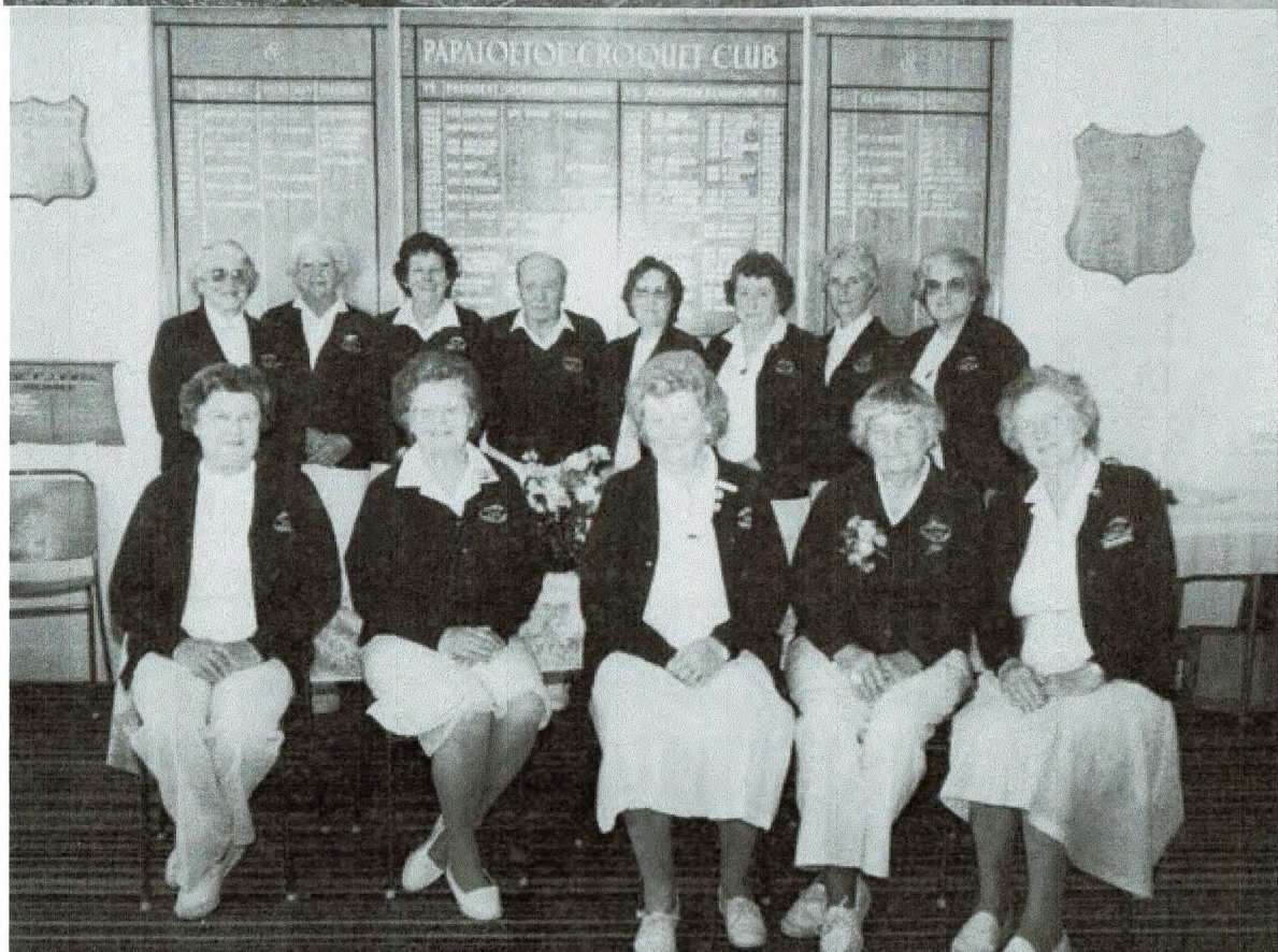
'Papatoetoe Croquet Club 75th anniversary portrait', 1988.

To enquire about copyright or reproduction rights,