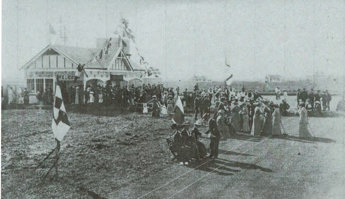
Opening day, Papatoetoe Croquet Club, September 1914.

Identified as the opening day of the Papatoetoe Croquet Club in September 1914. The occasion may in fact be the joint opening of the Papatoetoe Bowling Club and Papatoetoe Croquet Club's pavilion and greens on the Papatoetoe Recreation Ground, Great South Road, Papatoetoe, 8 November 1913.