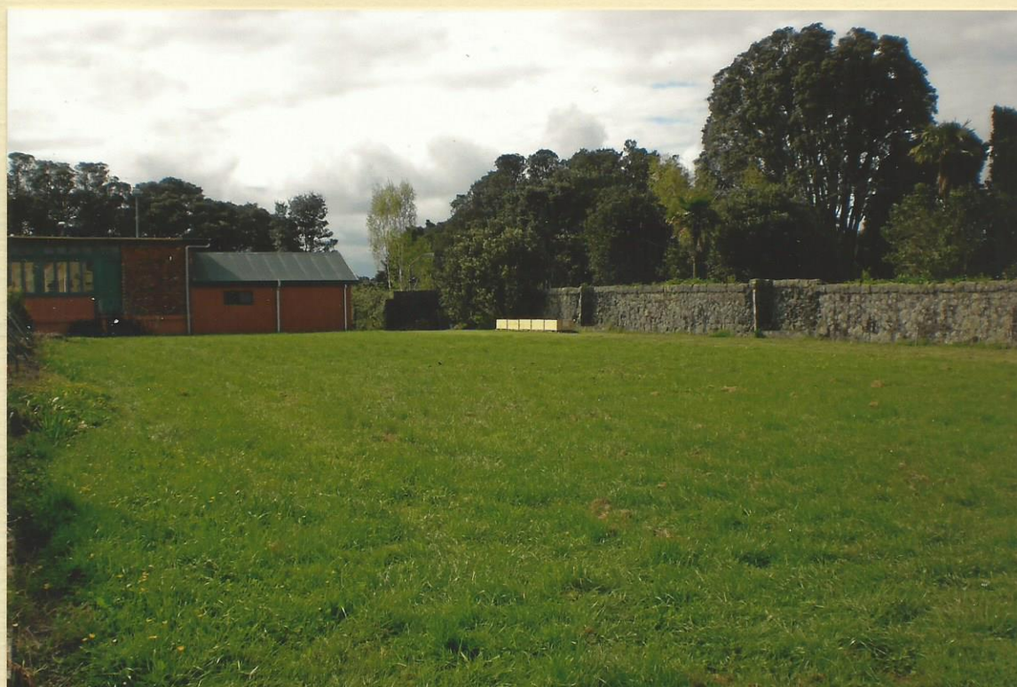
2010 Mt Eden Croquet Club clubhouse and northern end of lawns . . . and southern end of lawns — location Mt Eden Bowling Club