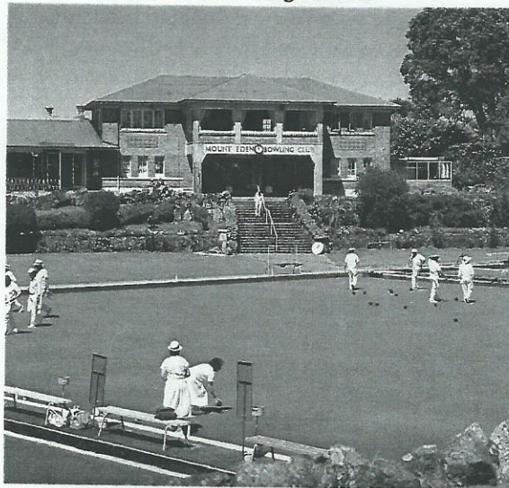
Mount Eden & Combined Bowling Club

which tons of scoria had been taken, and was cavernous and rugged with veins of rock jutting upwards. The site was filled in with all kinds of rubble—tree trunks, rocks, old cars—before it was levelled off and the topsoil laid. The greens were formed by the Borough Council, and officially opened in October 1929. The pavilion was built and completed for the following season.