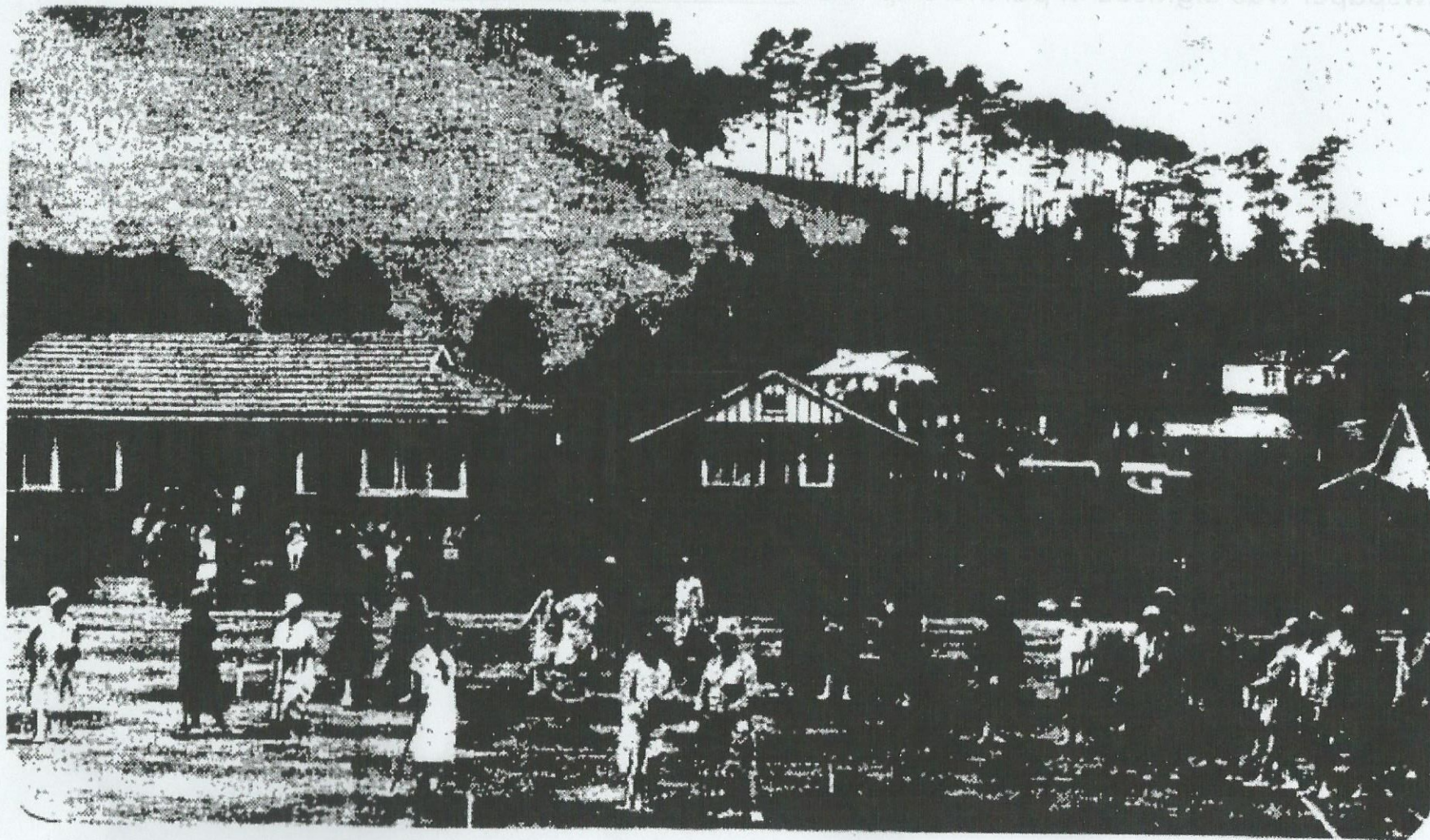
CROQUET "AT HOME" AT MOUNT EDEN CLUB—A general view of the play during the afternoon.