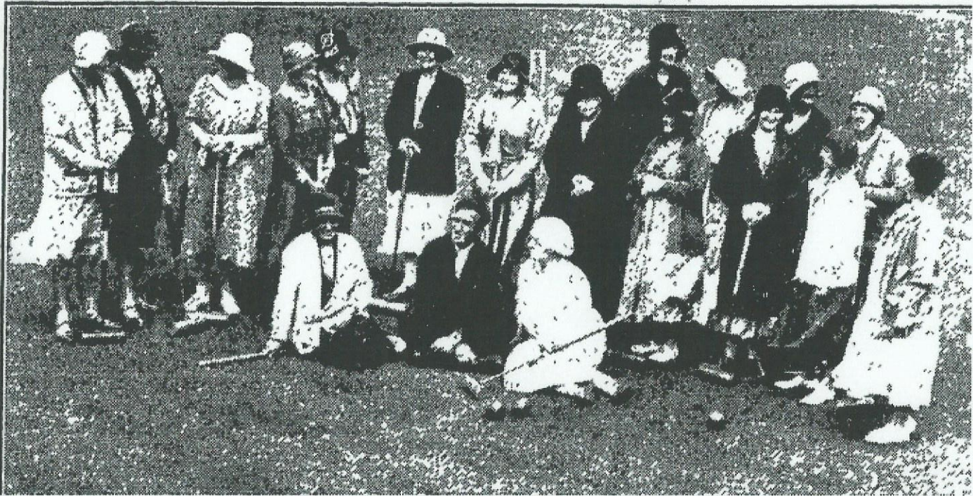
ANOTHER CROQUET CLUB OPENED.—Some of the members of the Grey Lynn Croquet Club assembled on the green after the official opening yesterday.

Papers Past — Auckland Star — 17 July 1933 — SOCIAL