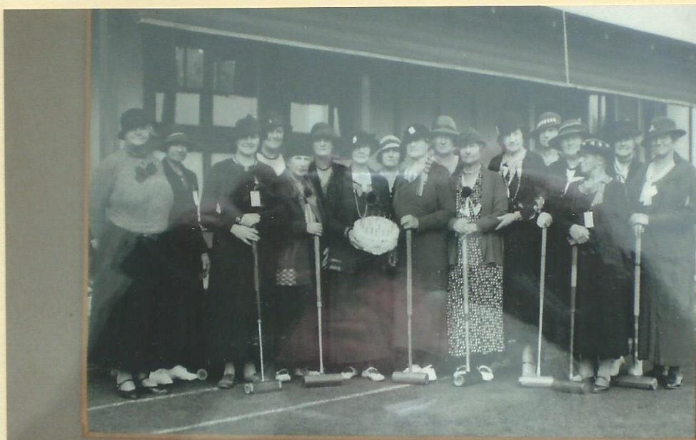
MEMBERS OF COMMITTEES 1934-35