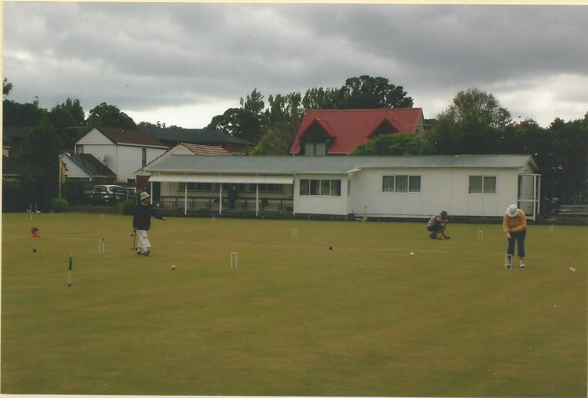
Extended clubrooms 2011